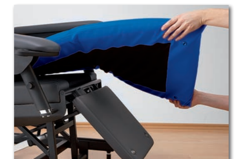
The removable and easy to clean mattress offers in combination with the base upholstery long-lasting comfort.