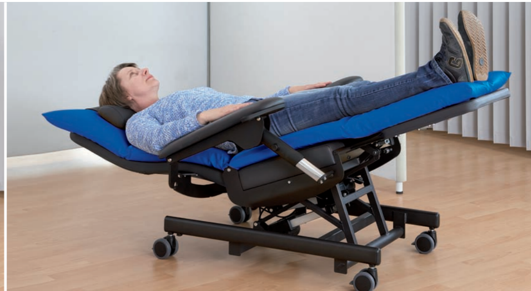
In case of an emergency the SlimLine can be moved into a lowered head position for cardio pulmonar rescue by pushing a button. Although the base frame is small and space-saving it offers perfect stability.

The SlimLine Therapy Chair has been developed for the needs in your oncology clinic and the infusion therapies.